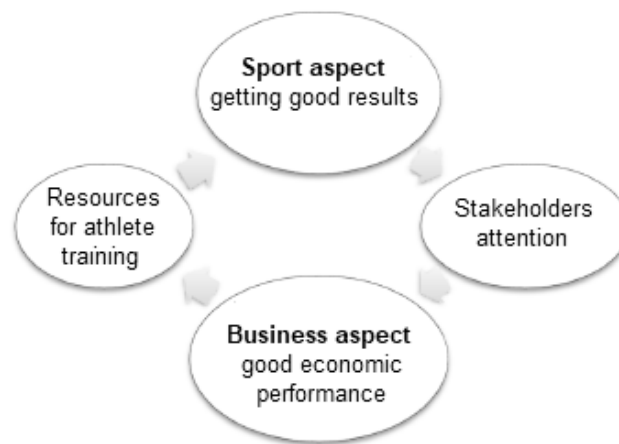
Fig. 1 The cyclical relationship between aspects of sports business [6]

On this basis, it can be concluded that the goals of sports organisations and the goals of enterprises, but above all the ways of achieving them, have common overlaps in many factors. This opens up the possibility of using established procedures and processes in the field of enterprise risk management also in the field of risk management in the environment of sports organisations. However, as there is no clearly defined specific standard or norm in this area, it also opens up the possibility of implementing new approaches and optimising them specifically for the needs of sports organisations in order to make them as effective as possible in practice.