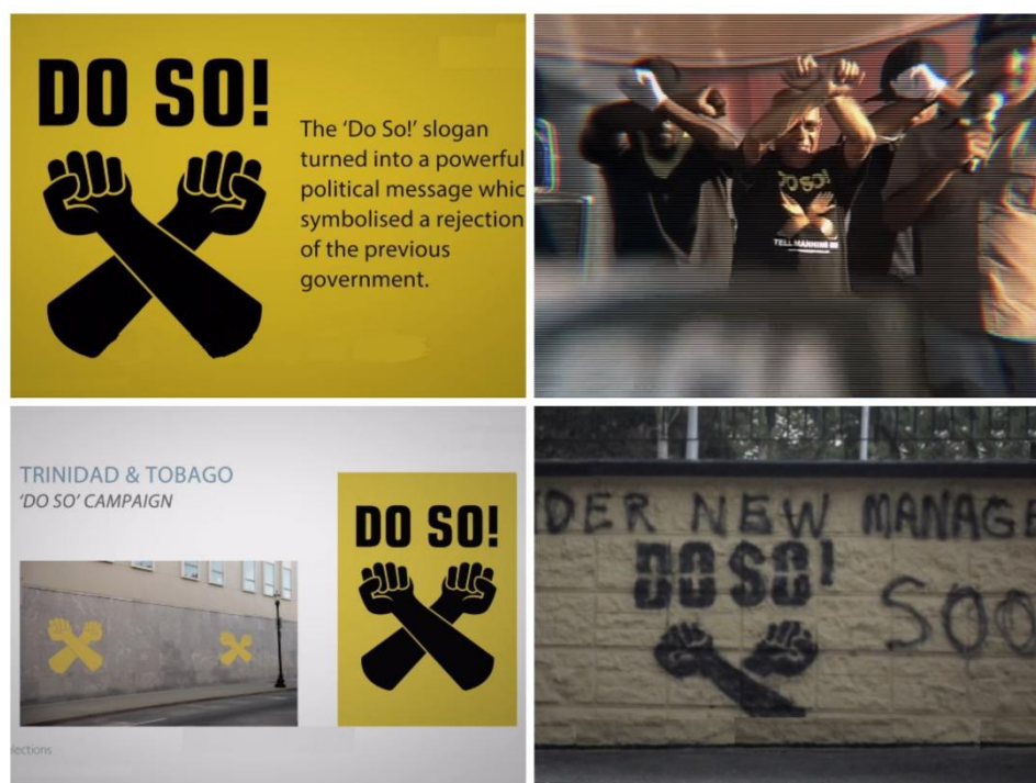
Figure 2 Part of the promotion behavior of the “Do So” activity

operation strategy aimed at weakening the opponent's support base by encouraging young voters not to vote (Figure 2 shows some promotional activities of the "Do So" campaign). SCL deeply analyzed the target group and used marketing and communication strategies to promote the "Do So" message through multiple channels such as social media, advertising, and public events. This strategy appeared to be a grassroots social movement but actually leveraged young people's disappointment and dissatisfaction with politics, encouraging them to express their protest by not voting. The politics of Trinidad and Tobago are divided into religious and secular factions. SCL's strategy cleverly influenced the secular faction through neutral activities, while the religious faction was less affected due to family and religious ties. The results showed that in the 18-35 age group, the religious faction reversed 35% of the vote, winning unexpectedly. SCL's strategy successfully influenced voting behavior, achieving the client's goal.