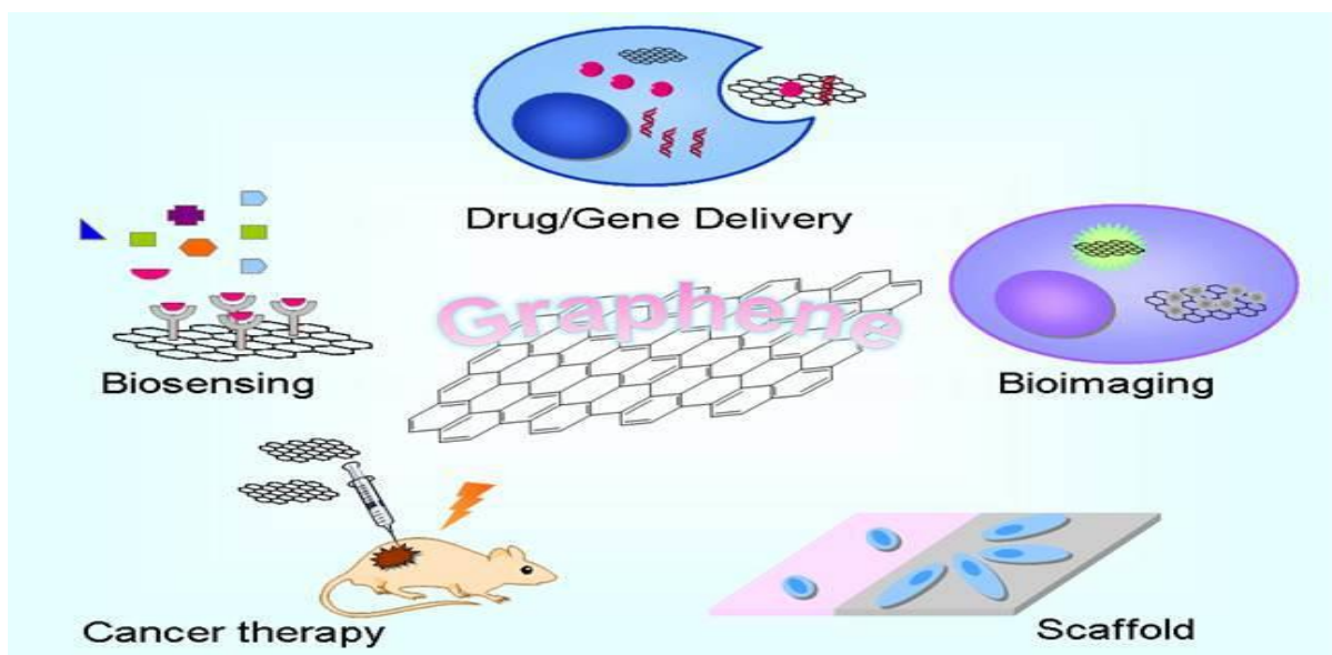
Fig. 5: Biomedical Applications of Graphene

Graphene-based materials such as Graphene Oxide, few-layer Graphene flakes, and virgin Graphene. Graphene has adaptable, distinctive, and diversified characteristics that may be innovatively used in the biomedical business. Graphene uses include biological agents (antimicrobials), tissue engineering, sensors, and transport systems. Research is now underway to produce groundbreaking and new medical devices that will substantially improve healthcare, recognizing the promising and advantageous features of graphene.