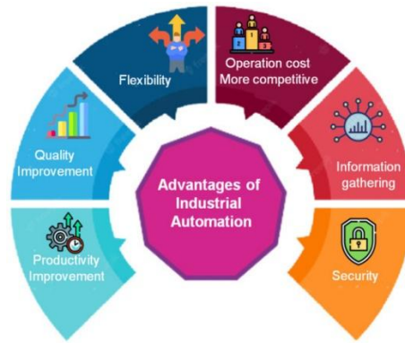
Figure 2: Advantages of Industrial Automation

(Mbewe, 2022) investigated the preparedness for Industry 4.0 in Zambia and discovered that although SCADA systems are present in mining and utilities, their integration with AI is weak due to insufficient investment and a lack of skilled personnel. Such scenarios require tailored frameworks and partnerships among government, industry, and academics to ensure equitable technological progress. In Zambia, such collaboration is essential due to the prevailing deficiencies in AI knowledge, constrained research funds, and the sluggish advancement of industrial digital transformation (Kaluba, 2021). Successful integration of AI-SCADA in industries like mining and energy necessitates regionally tailored implementation frameworks, policy endorsement, and proactive collaboration among academic institutions, industry executives, and regulatory authorities to guarantee sustained and contextually relevant innovation.